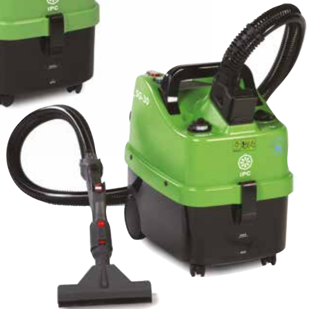
SG-30 - BOILER WITH AUTO-FILLING TANK